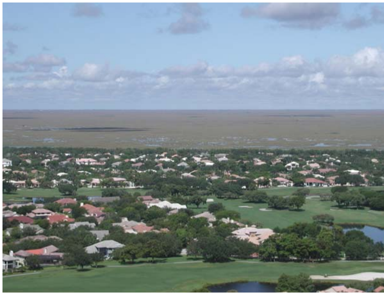
Intersection of Urban Area and the Everglades, looking west from Central Broward County