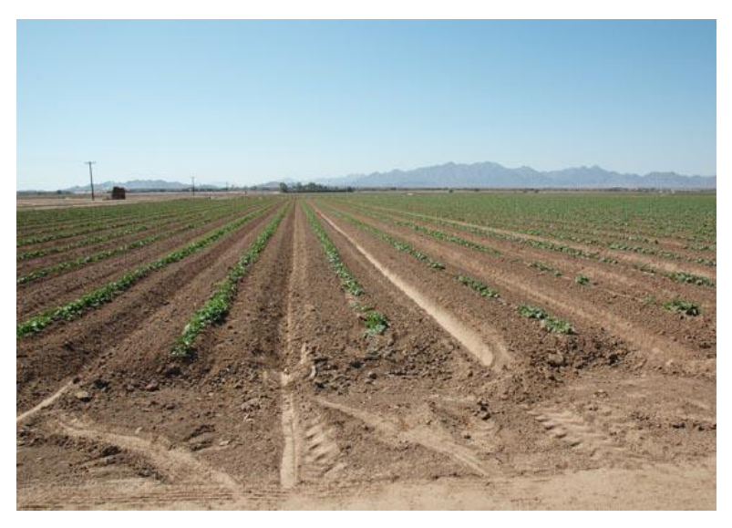
Fig. 3 Irrigated field, Wellton, Arizona.

Over the past century, humans have endeavored to challenge Nature's design by irrigating arid lands, that is, moving water great distances to irrigate the deserts, thereby making them productive (Fig. 3). Since deserts have a store of nutrients, all that is required to start using those nutrients is to add imported water to the soil.