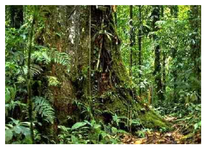
Fig. 2 The Amazon rainforest.

Therein the dichotomy: In arid regions, there are plenty of nutrients, but not enough water; in humid regions, there is plenty of water, but not enough nutrients. At the extremes of the climatic spectrum, regions where mean annual precipitation is less than 100 mm are referred to as superarid; regions with mean annual precipitation greater than 6400 mm are referred to as superhumid (Ponce et al. 2000). In superarid regions, life is hard because there is very little water. In superhumid regions, life is hard, particularly for humans, because most of the nutrients have been leached out of the soil.