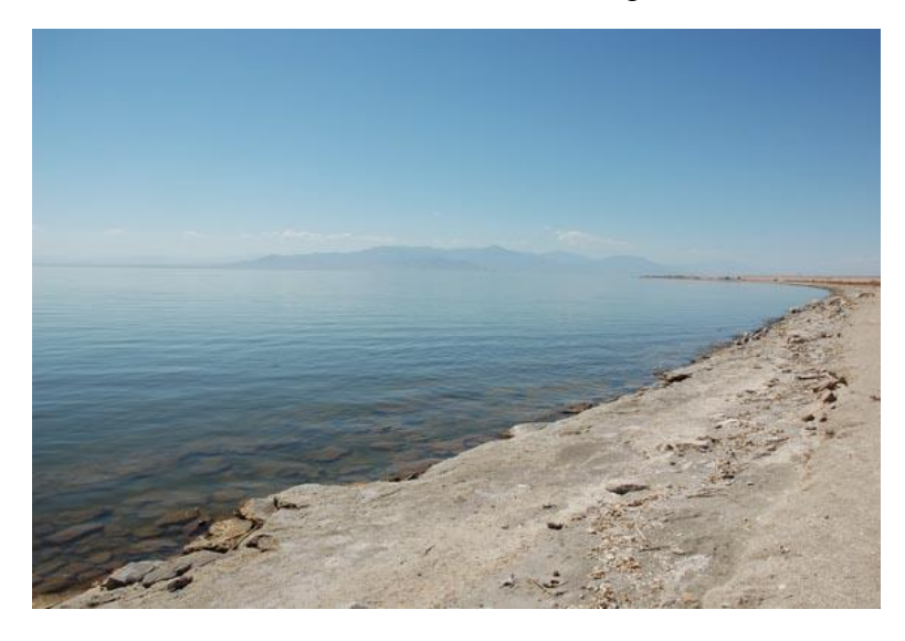
Fig. 5 The Salton Sea.

How to cope with the natural distribution of water and nutrients across the climatic spectrum? By all accounts, the import of water into arid regions solves the problem of water supply, but this is necessarily at the cost of creating a problem of salt disposal. In effect, the two major salts, calcium and sodium, are produced from soils in greater quantities than needed by the artificial ecosystems, and thus end up polluting neighboring watercourses in the case of open drainage systems, or inland lakes in the case of closed drainage systems. For instance, the salinity of the Salton Sea, in California, a closed system which has been receiving agricultural drainage for the past 100 years continues to increase, with no end in sight (Ponce 2009) (Fig. 5).