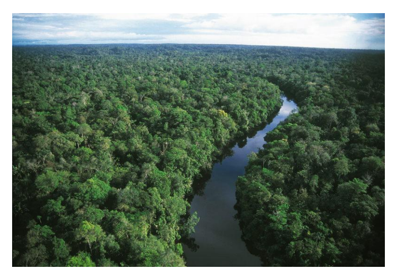
Fig. 4 The Amazon rainforest.

Superhumid regions, though, remain largely unexploited by humans, because most people are uncomfortable in the high humidity that prevails in these regions (Fig. 4).