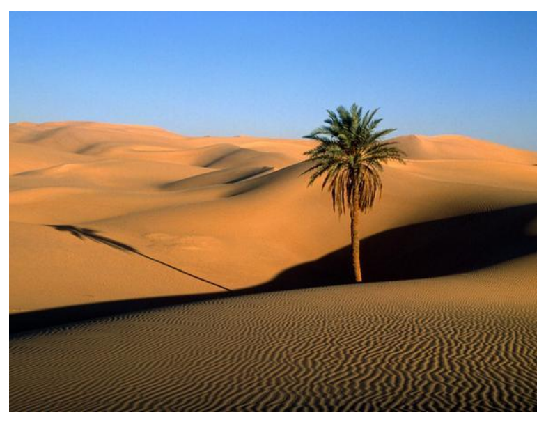
Fig. 1 The Sahara Desert.

Therein the dichotomy: In arid regions, there are plenty of nutrients, but not enough water; in humid regions, there is plenty of water, but not enough nutrients. At the extremes of the climatic spectrum, regions where mean annual precipitation is less than 100 mm are referred to as superarid; regions with mean annual precipitation greater than 6400 mm are referred to as superhumid (Ponce et al. 2000). In superarid regions, life is hard because there is very little water. In superhumid regions, life is hard, particularly for humans, because most of the nutrients have been leached out of the soil.